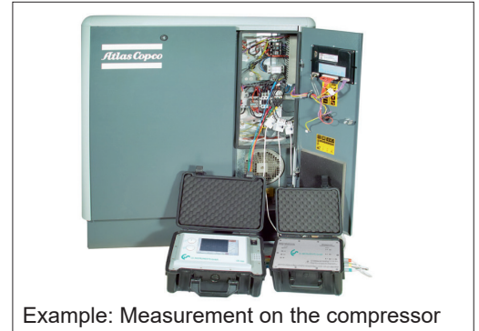
Example: Measurement on the compressor

Magnetic voltage measuring tips electrically isolated