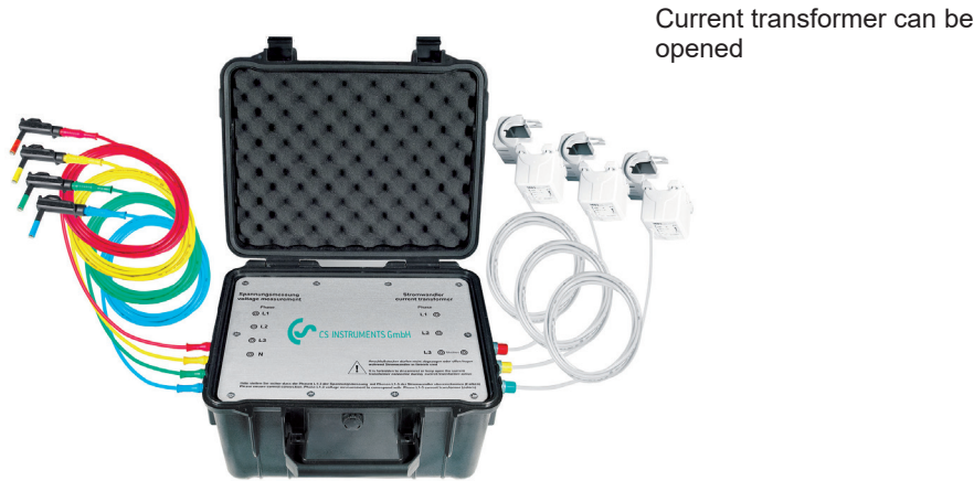
Current transformer can be opened

All measured data are transferred digitally (Modbus) to DS 500 mobile/ DS 400 mobile and can be recorded there.