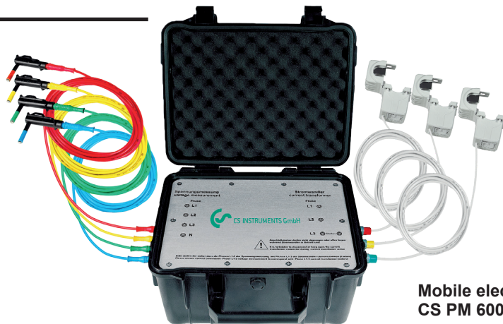
Mobile electricity/effective power meter CS PM 600