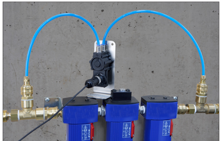
Typical application of the differential pressure sensor: connection with two PE hoses before and after filter elements.