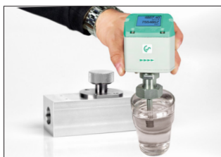
The sensor can be removed from the measuring section and cleaned.